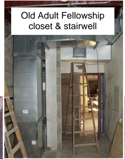
Old Adult Fellowship closet & stairwell