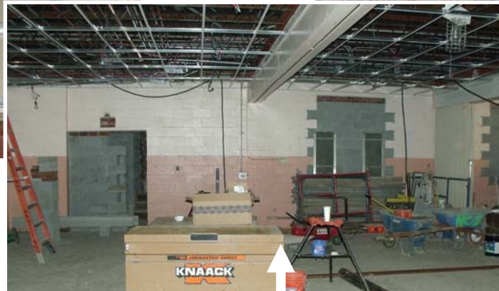
Blocking off the old door and window in the Fellowship Hall