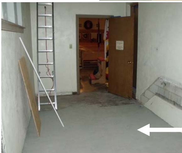
Room off Chancel for better storage