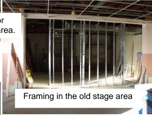
Framing in the old stage area