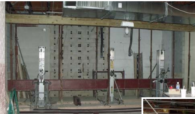
Putting in a steel beam for support under the Chancel area.