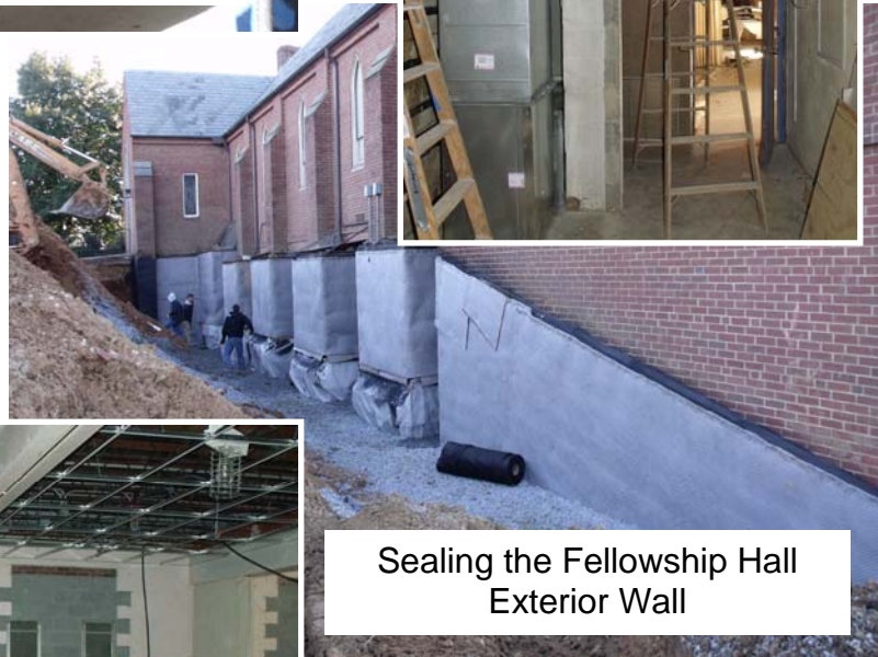
Sealing the Fellowship Hall Exterior Wall